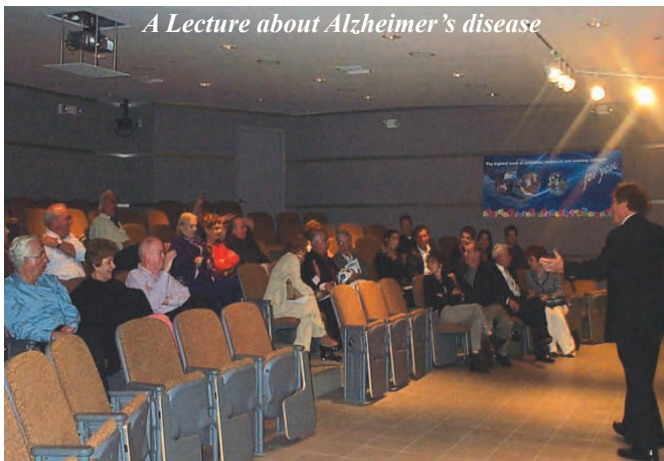
A Lecture about Alzheimer's disease