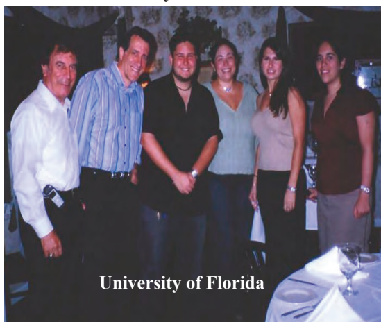
University of Florida