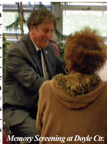
Memory Screening at Doyle Ctr.